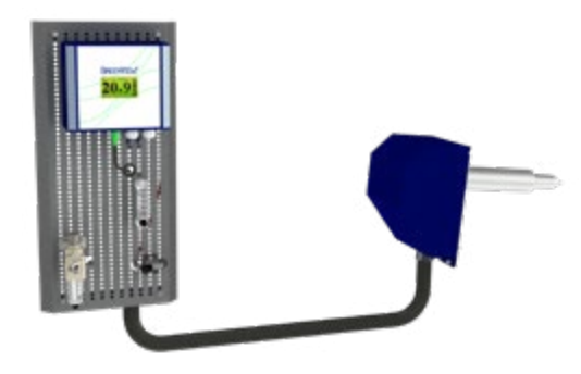
G3621 Stack Gas Oxygen Analyzing System