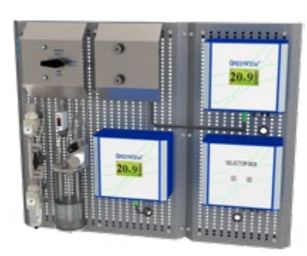
G3600/3601 Inert Gas Oxygen Analyzing System