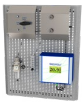
G3610/G3611 Nitrogen Generator Analyzing System